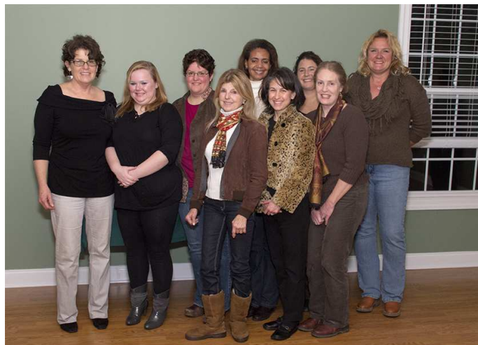
Members of the CTDA 70% Club